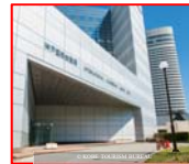
R-CCS / Fugaku